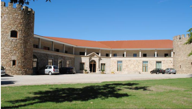
Hotel and SPA Penamacor (Portugal)