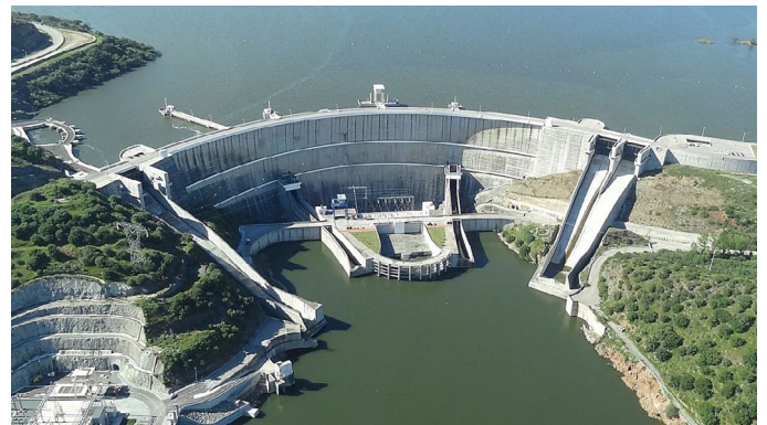
Alqueva Dam (Portugal)

Waste Treatment Plan Neves and Ribeira Afonso (Sao Tome and Principe)