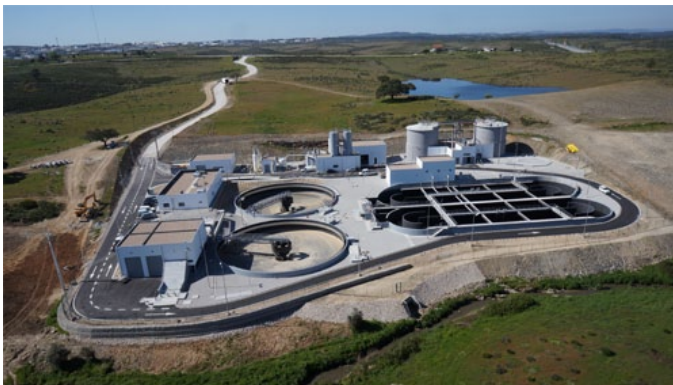
WWTP Castelo Branco (Portugal)