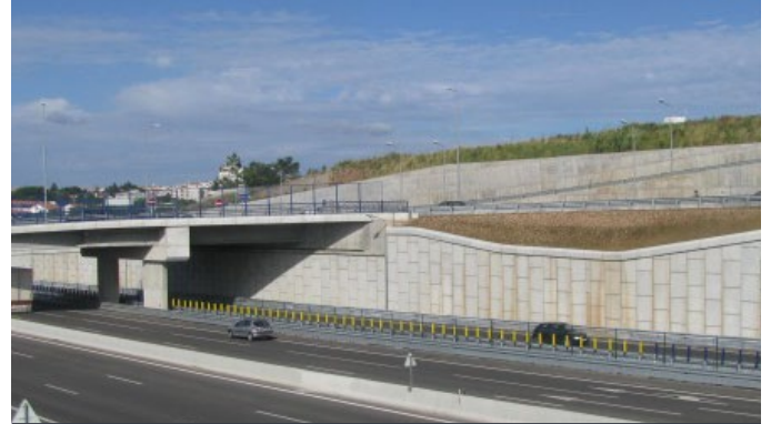
Sub's of Litoral Oeste (Portugal)